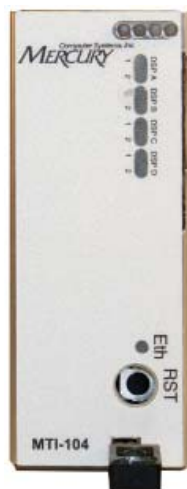
Figure 1. MTI-104 faceplate

The front panel has a set of LEDs to indicate the status the DSPs. Four IPMI LEDs are provided per the AMC specification. The LEDs are user-programmable to indicate DSP status or to test the infrastructure JTAGs that support programming and debugging of the application on the board.